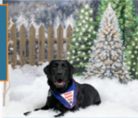
HAPPY HOWL-IDAYS FROM ALL OF US AT LEADER DOGS FOR THE BLIND!

Leader Dogs for the Blind - Lions Newsletter