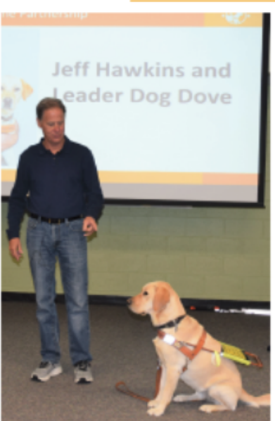
Leader Dogs for the Blind | 1039 S Rochester Rd | Rochester Hills, MI 48307