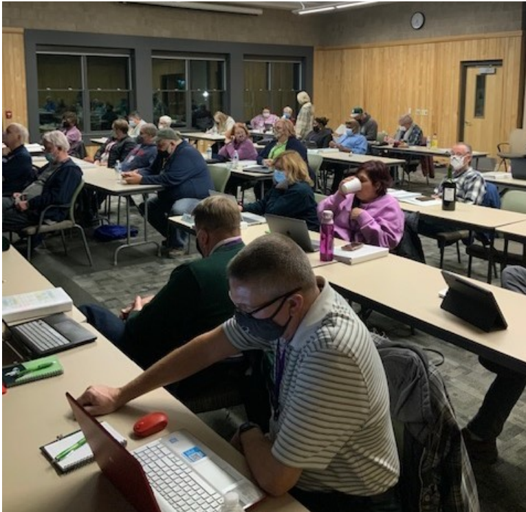
The Lions Leadership Institute was held in Higgins Lake November 5-7. Students are shown here learning the ins and outs of ZOOM meetings.