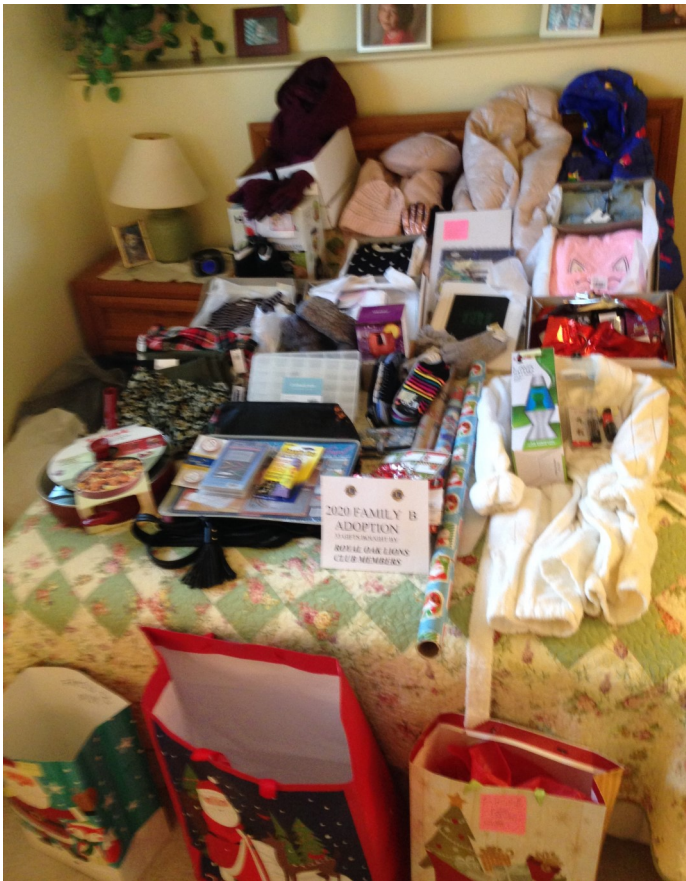
The Royal Oak Lions Club adopted two families for the Holidays this year. Shown here are the gifts assembled for one of the families.