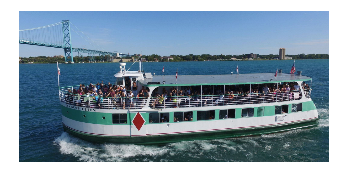
May 11, 2019

This event, a District 11-A2 favorite, has returned after a 20 year absence. Enjoy an evening cruising the Detroit River on board the Diamond Belle. There will be dinner, drinks, dancing and 50/50 raffles! Tickets are $50 per person