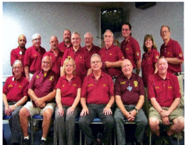
2013-2014 Cabinet Members Picture was taken at Installation